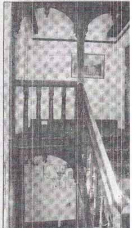
IMPRESSIVE: The grand staircase leads to seven bedrooms