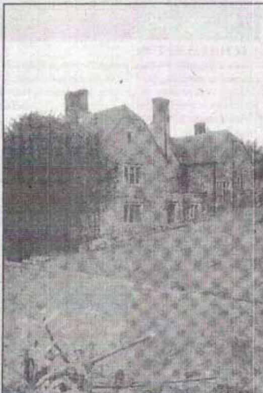
DESIRABLE: The manor is a hidden gem in the heart of Swindon