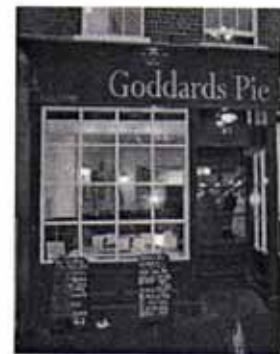
Our newly refurbish

[Top] [ Home ] [ Find Us ] [ Contact Us ] [ Opening Times ]