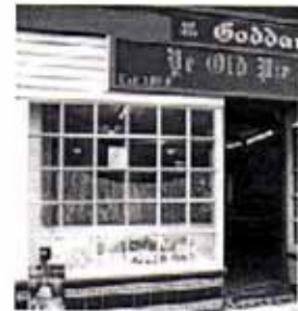
The original pie